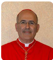
Cardinal José Tolentino Mendonça

Whenever the Church prepares for a new pope, something stirs in every Catholic country - "Could it be one of ours?" Here in Madeira, we quietly wonder too. After all, we have a Cardinal of our own - José Tolentino Mendonça - born and formed on this very island. A man of prayer and poetry, of deep thought and gentle witness. He, like Pope Francis, has shown us that the heart of the Gospel is mercy - God's mercy that never gives up on anyone.